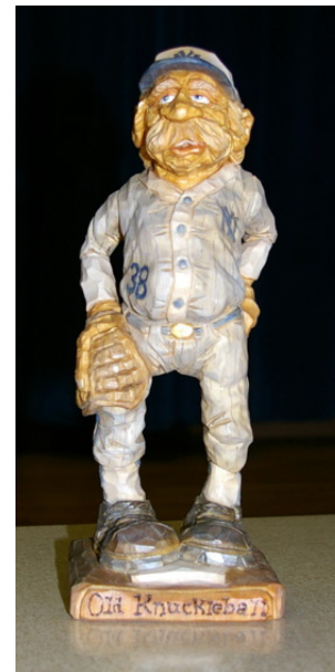
Baseball Player caricatures carved by PJ Driscoll.