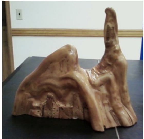
Cypress knee carving by David Howe