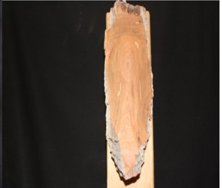
Clean off all the loose bark down till you reach solid bark