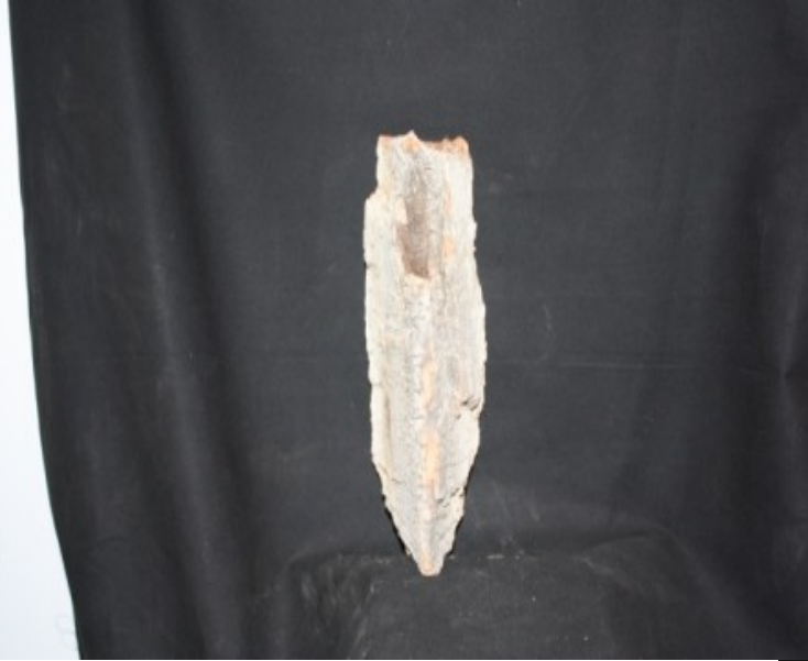
Typical chunk of bark