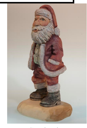
Carving by Corey Halligan

We ask that you sign up so we can get a head count to make sure we have enough food for everyone.