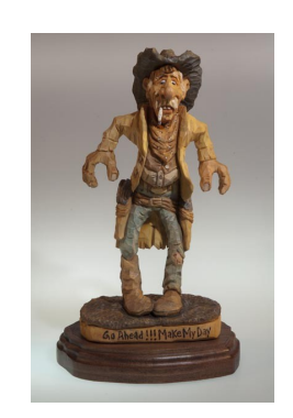
Carved by PJ Driscoll